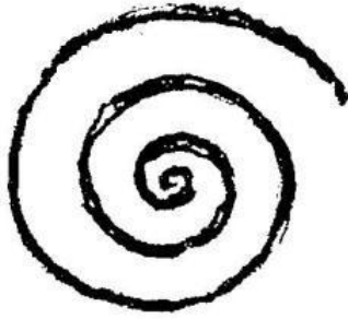
Fig. 2. Same spring un-wound to exemplify decen-tration.