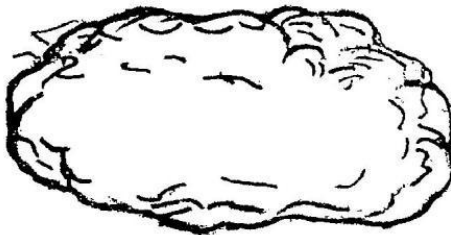
Fig. 3 & 4 represents water concentrated into a drop and de-centrated into vapor.